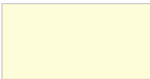
Vanilla Yellow 323