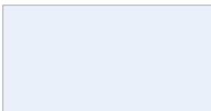
Ice Blue 413