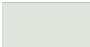
Polar Green 713