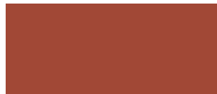
Tile Red 637