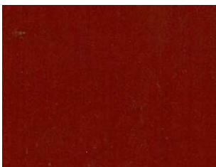
Red (close to RAL 3009)