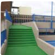
Walkways & Stairwells