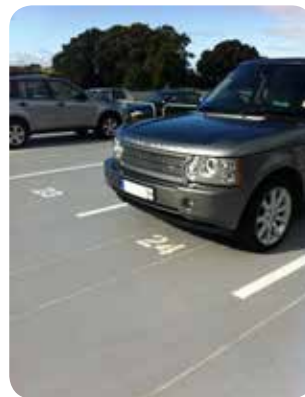
Roof Level Deck Membrane Systems