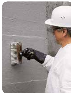
Architectural Wall Coatings