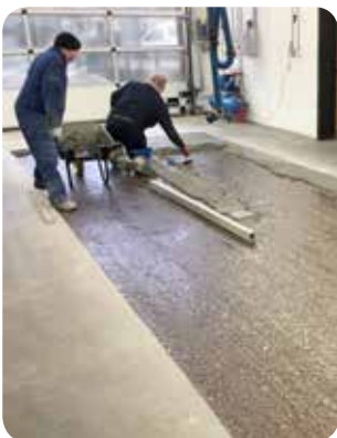
Concrete Repair Materials