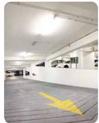
Heavy Duty Systems for Ramps & Turning Circles