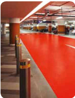
Basement Level Deck Membrane Systems