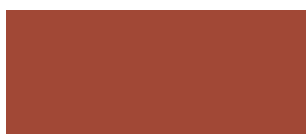
Tile Red 637