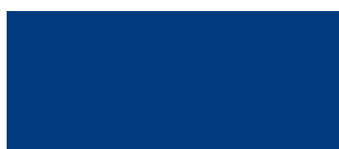
Traffic Blue 466

The applied colours may differ slightly from the examples shown above. Contact our customer services for a true colour sample or a special colour match.