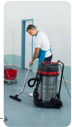
5 Remove Remove the cleaning product from the floor.