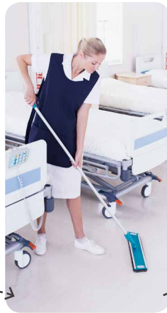
2 Apply Apply the cleaning product to the floor.