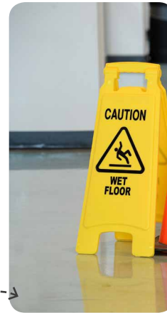
4 Soak Allow time for the cleaning product to sit on the floor.