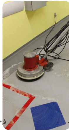
3 Agitate Agitate the cleaning product to release agents.