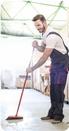
1 Sweep Always sweep the floor before proper cleaning.

The best method for cleaning Flowcrete floors is to have a five step process. This process varies between small and large floors and between textured and smooth floors.